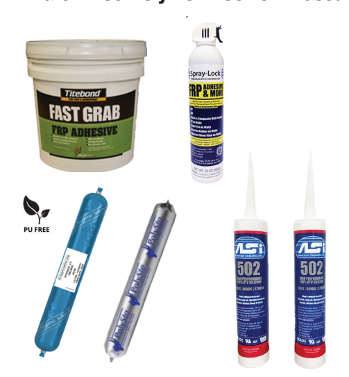
For more product details, please visit www.Nudo.com