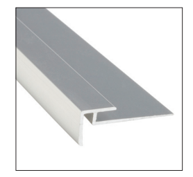
Outside Corner ACS-100-10-0C